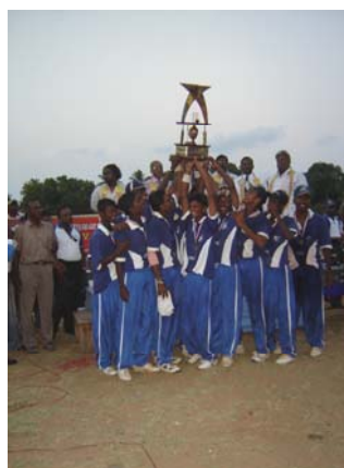
JHC Team with the Trophy